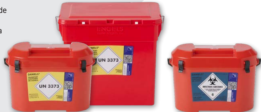
Diagnostic Specimen Containers Available in a 7L and 30L

*when used in conjunction with a SHARPSGUARD® sharps container