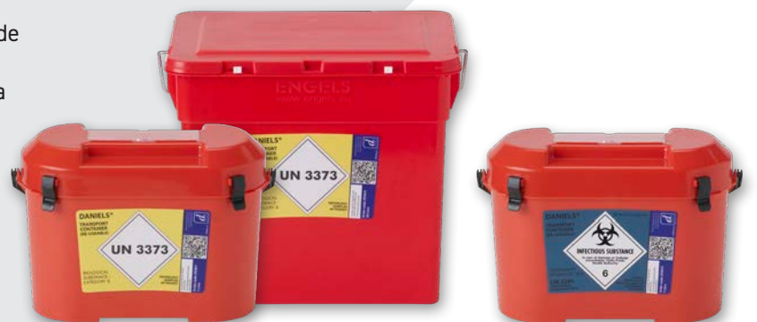
Diagnostic Specimen Containers Available in a 7L and 30L

*when used in conjunction with a SHARPSGUARD® sharps container